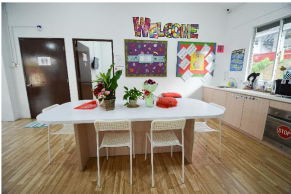
LIFE SKILLS KITCHEN