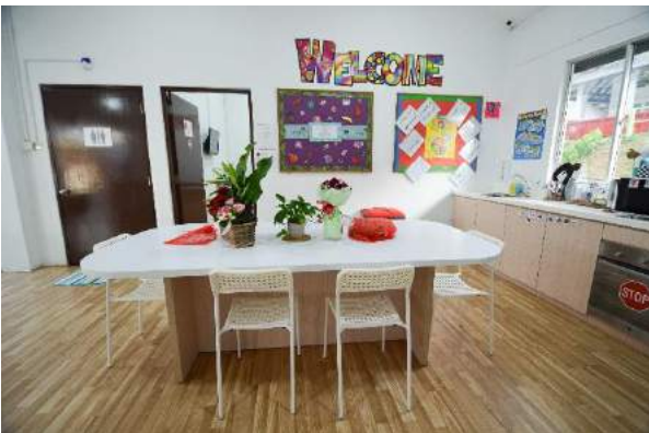
LIFE SKILLS KITCHEN